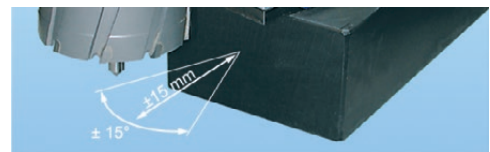
Swivel base in version PRO-76+